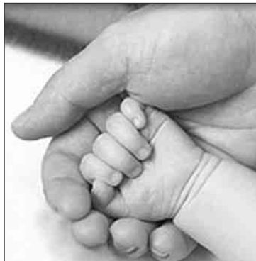
"In my mother's womb you knew me."

In a landmark 1998 paper, researchers at the Medical College of Georgia, in Augusta, USA, found that the mammalian embryo (they worked with mice) produces a special enzyme, called indoleamine 2,3-dioxygenase, or "IDO," which suppresses the mother's T cell reaction and allows pregnancy to proceed. Follow-up work in humans revealed the same effect, and it was also demonstrated that the IDO was produced on the embryo side of the placental membrane (which separates mother from child) and not on the mother's side. Further work in mice showed that IDO production peaked during the formation of the placenta—the most crucial time for establishing that vital link between mother and child. And the most recent work in humans has established beyond doubt that IDO is a specific mechanism at the