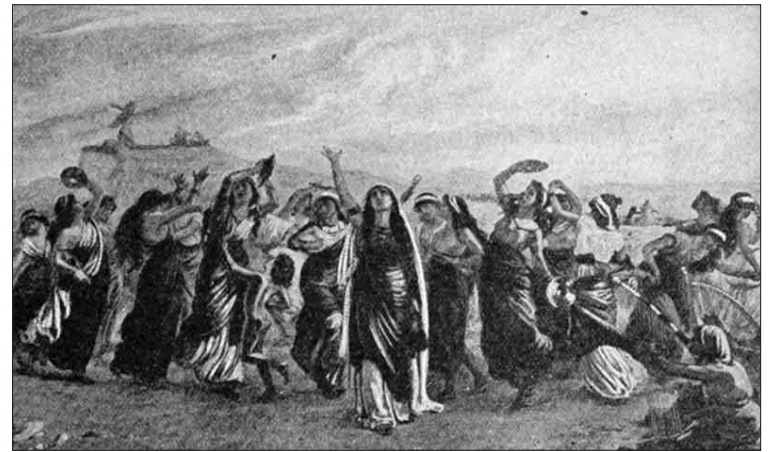
Miriam singing the song Moses wrote

Prefiguration is a form of prophecy by which the Holy Spirit foreshadowed, in the people and events of the Old Testament, the greater things to come in the future. It does not inform us of the things to come, as much as it enables us, when God's plan is fulfilled, to recognize His hand and design, and to believe with passion and conviction in the things He does. Well-recognized instances include the bread and wine offered by Melchisedek, and also the Passover meal, which prefigure the Eucharist; Melchisedek himself, prefiguring Our Lord's High Priesthood (Heb 5:7); Joseph, sold by his brothers into slavery only to become a great ruler who forgave and saved his brothers, prefigures Christ, Who was crucified by his own, but is their merciful King and Savior; Moses, who led his people out of slavery in Egypt, prefigures Christ leading us out of the darkness of sin. Jesus himself