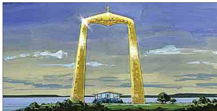
Artistic Conception of the Arch of Triumph of the Immaculate Heart of Mary