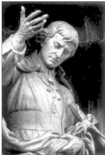
St. Louis de Montfort, "Apostle of Mary"

Immaculate One possessed by our Lord's Most Sacred Heart. Is it possible then, to love the Mother of Jesus too much? Theologically and metaphysically, it is not possible to love the Mother of Jesus and the Mother of all peoples too much.