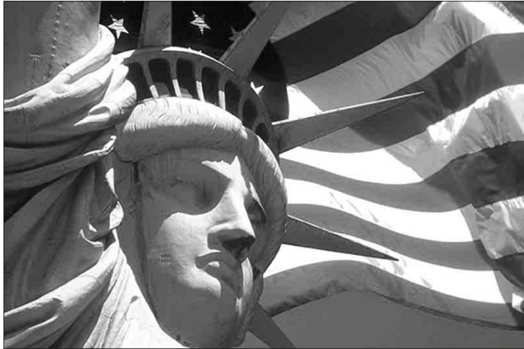
"Where the spirit of the Lord is, there is liberty." 2 Cor. 3:17

Consider these words that Thomas Jefferson wrote in the front of his well-worn Bible: "I am a real Christian, that